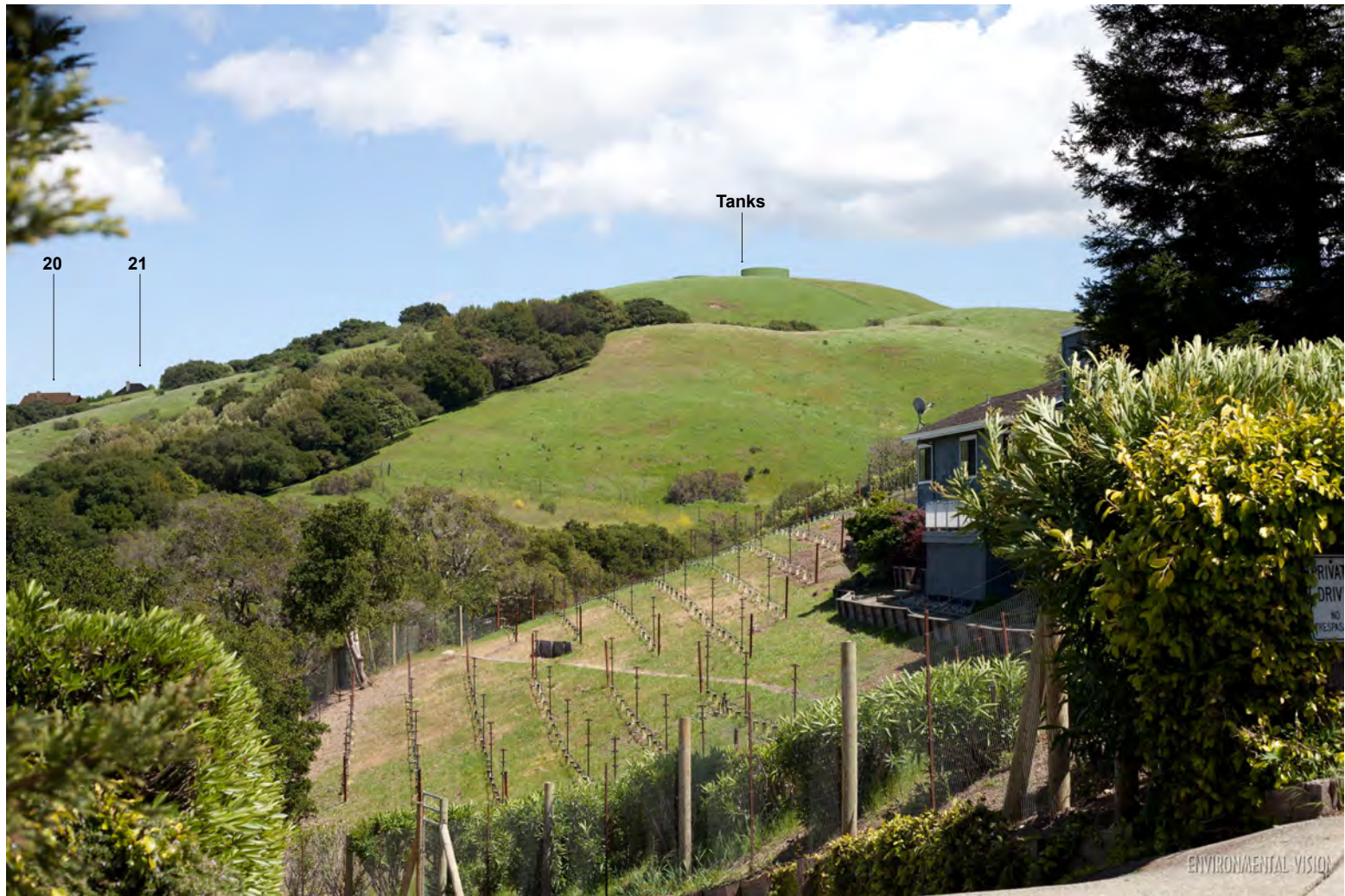
Annotated Visual Simulation of Alternative 3 - 37 Lot Plan (with lot numbers)

Annotated Visual Simulation of Alternative 3 - Joseph Drive Bollinger Valley Moraga, California