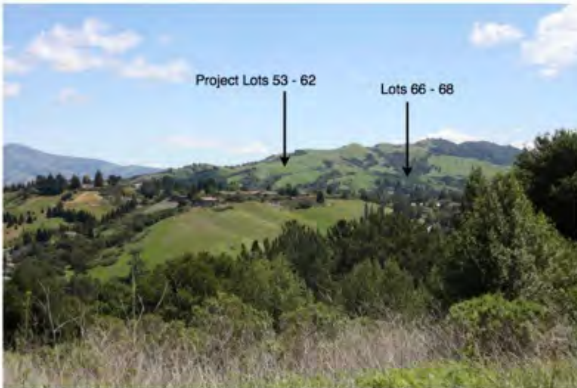
1. View from Mulholland Ridge Trail looking southeast