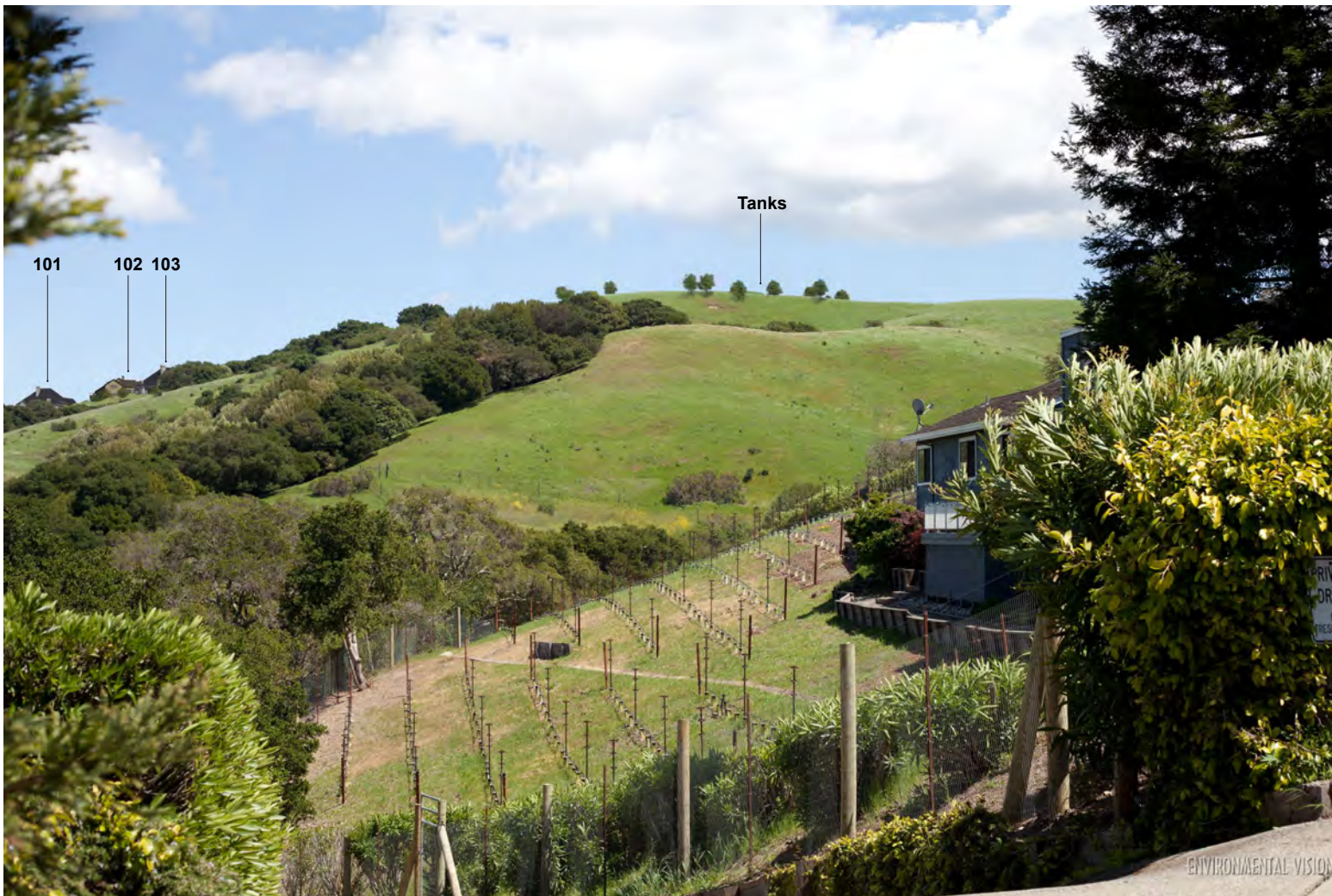
Annotated Visual Simulation of Alternative 5 - 121 Lot Plan (with lot numbers)

Note: Simulations of Alternatives 4 and 5 look the same from this viewpoint.