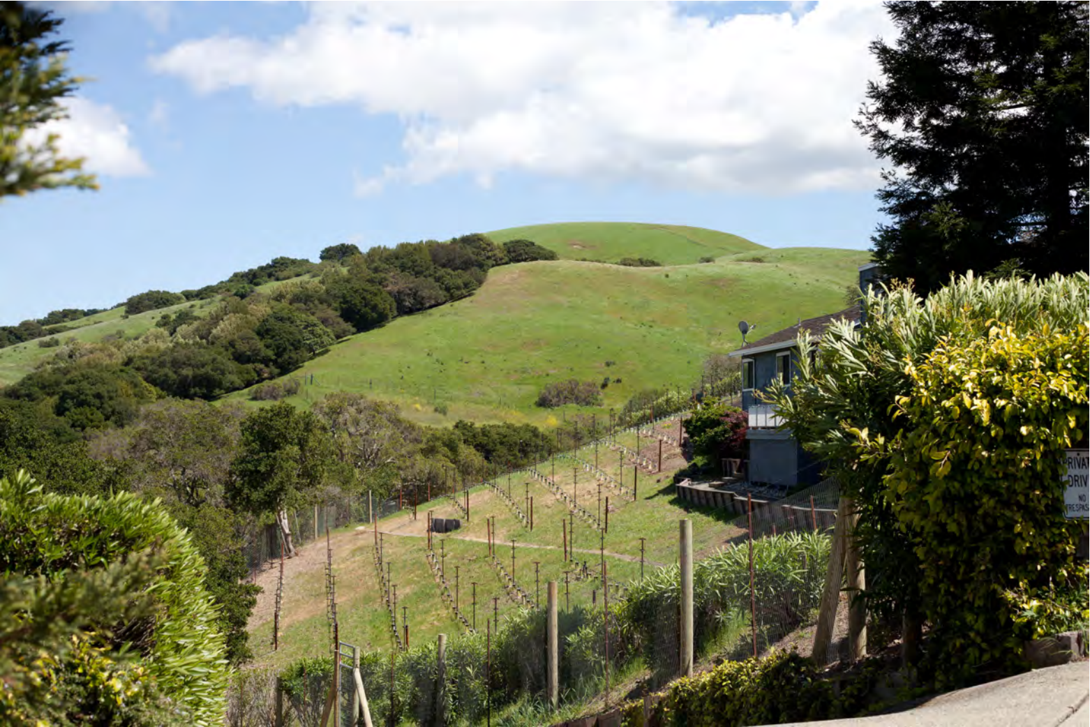
Existing View from Joseph Drive looking southeast

Existing View - Joseph Drive Bollinger Valley Moraga, California