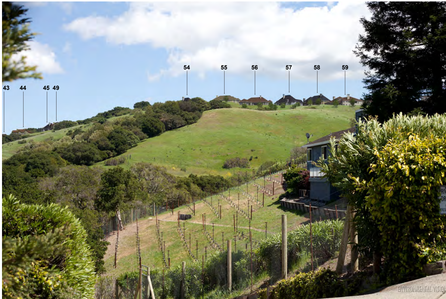
Annotated Visual Simulation of the Proposed Project - 126 Lot Plan (with lot numbers)