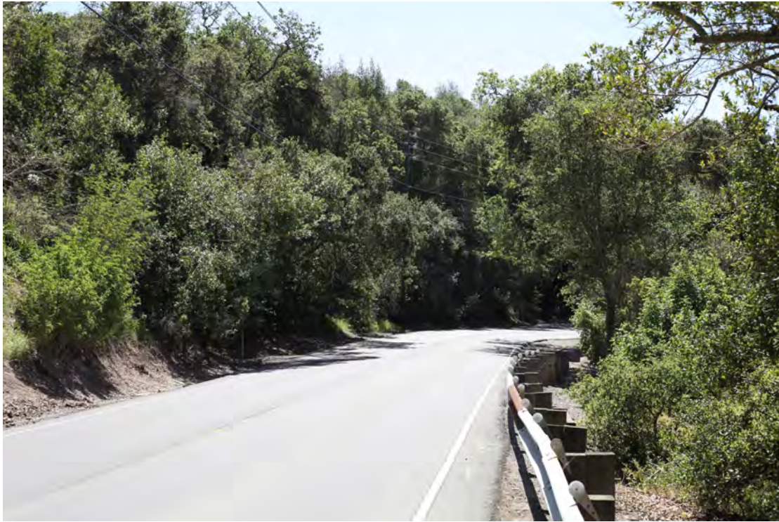
3. View from Saint Mary's Road near proposed EVA looking southwest