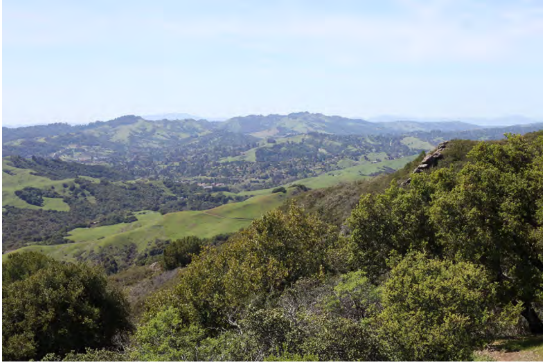
7. View from Las Trampas Peak looking northwest