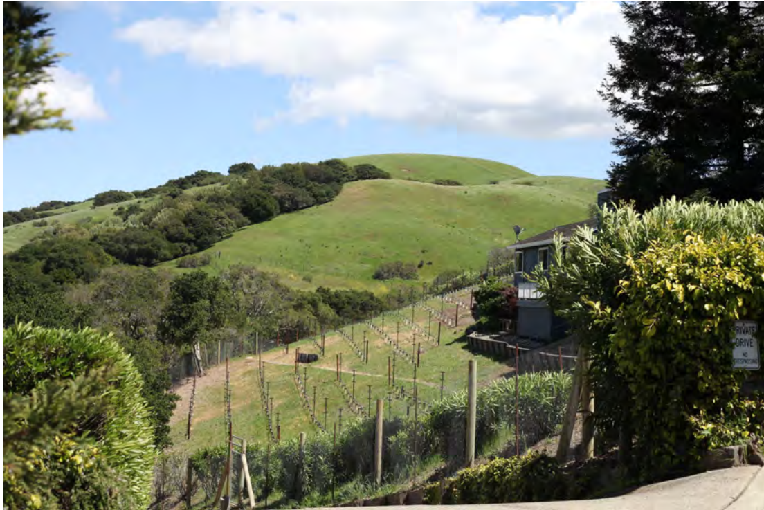
5. View from Joseph Drive looking southeast