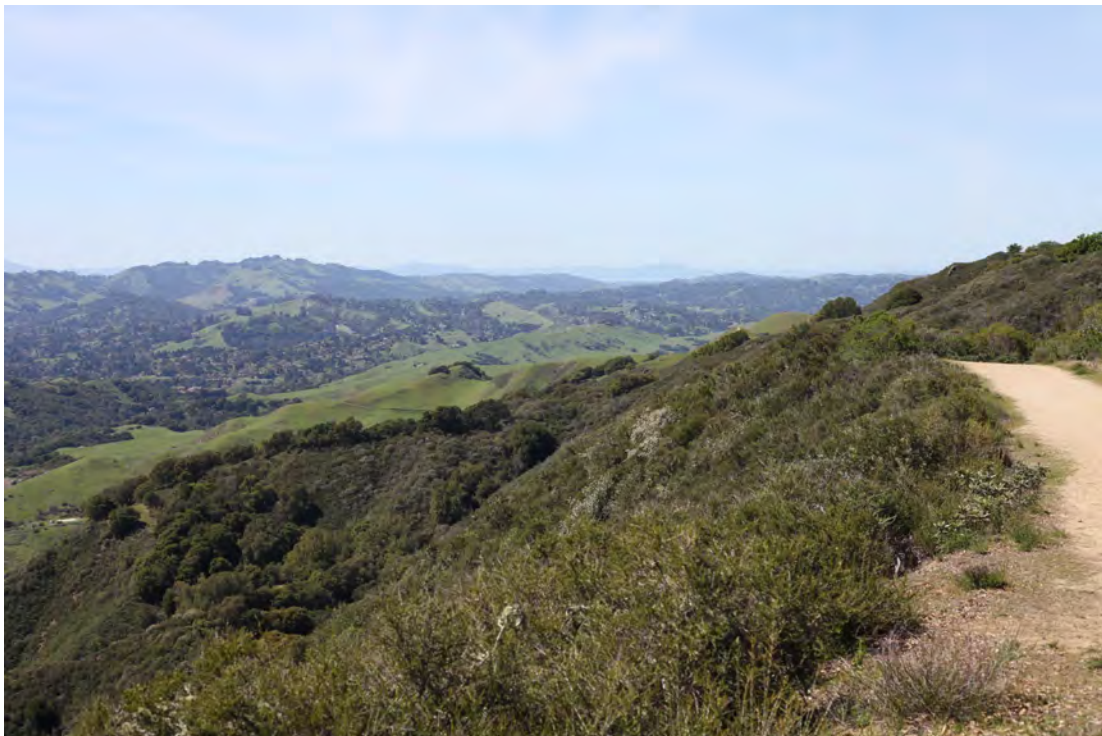
8. View from Las Trampas Ridge Trail looking northwest

Candidate Simulation Photographs Bollinger Valley Moraga, California