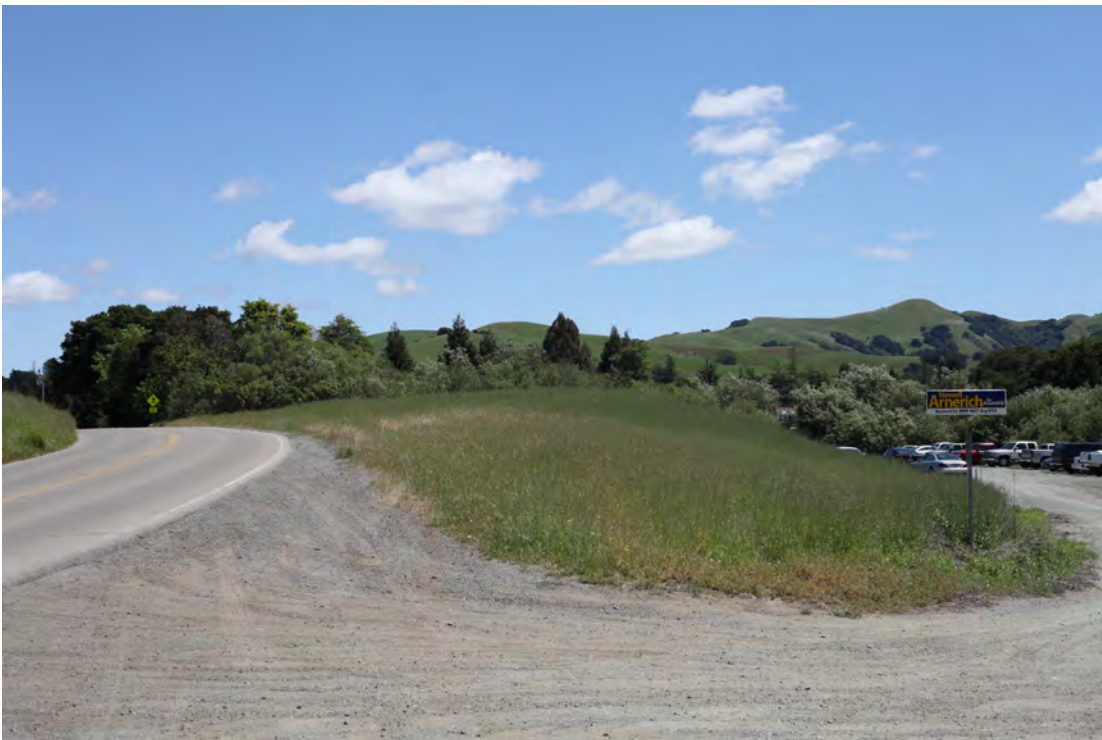
2. View from Saint Mary's Road near Stafford Road looking east

Candidate Simulation Photographs Bollinger Valley Moraga, California