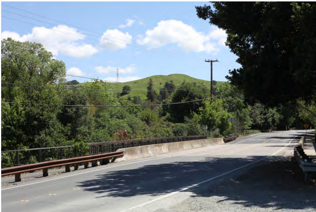
4. View from Saint Mary's Road near South Lucille Lane looking southeast

Candidate Simulation Photographs Bollinger Valley Moraga, California