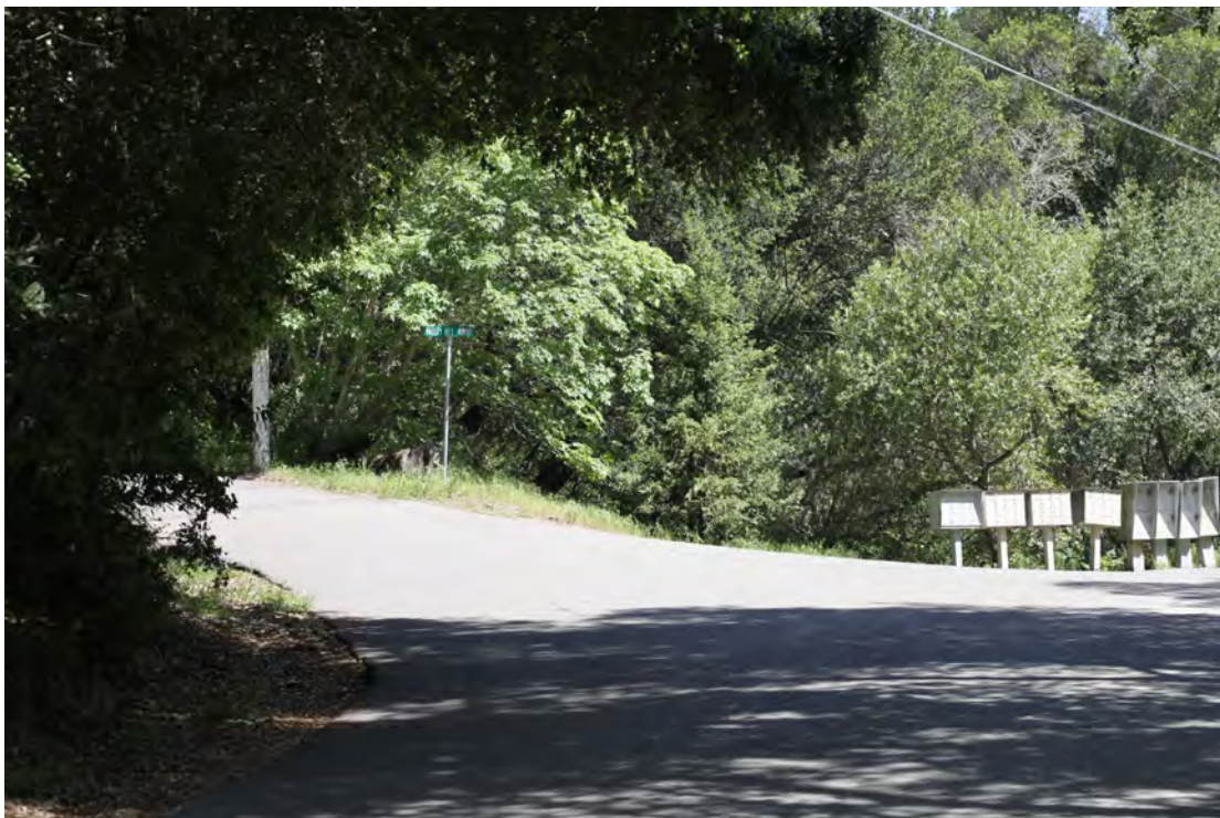
6. View from Bollinger Canyon Road near Valley Hills Drive looking southeast

Candidate Simulation Photographs Bollinger Valley Moraga, California