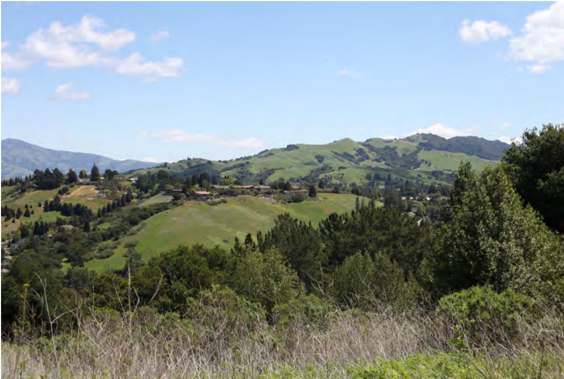
1. View from Mulholland Ridge Trail looking southeast